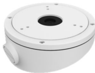
DS-1281ZJ-M Inclined Base Mounting Bracket