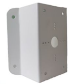
DS-1276ZJ Corner Mounting Bracket