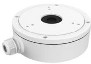
DS-1280ZJ-M Junction Box